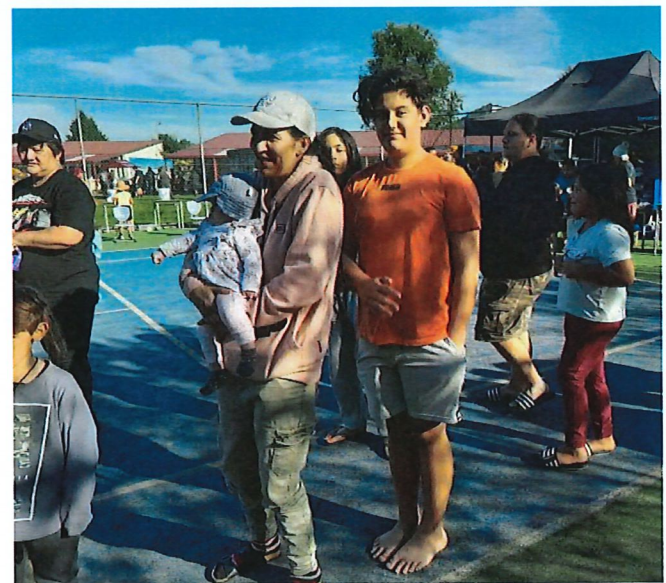
Many whaanau were curious with the games but those 'Leaders' had it covered and helped everyone enjoy themselves.