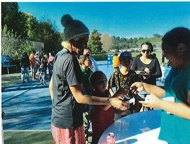
Get your tickets and have a go...