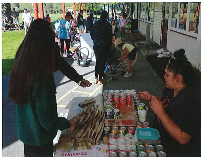
The White Elephant stall and kai stalls had plenty going on...