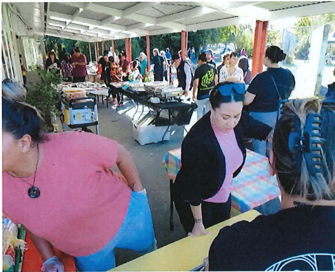
Lots of kai kept everyone happy (& busy)