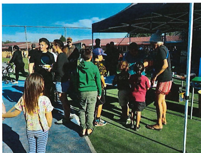
Lots happening here... Which games...Hmmm