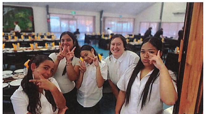
Not sure if this picture is correct...Some are students from Te Kura Rautau...Some are not...And one looks like she's pretending to be...(Can you spot this person?)

The team did a fantastic job of catering, waitressing and helping out for the Poukai.