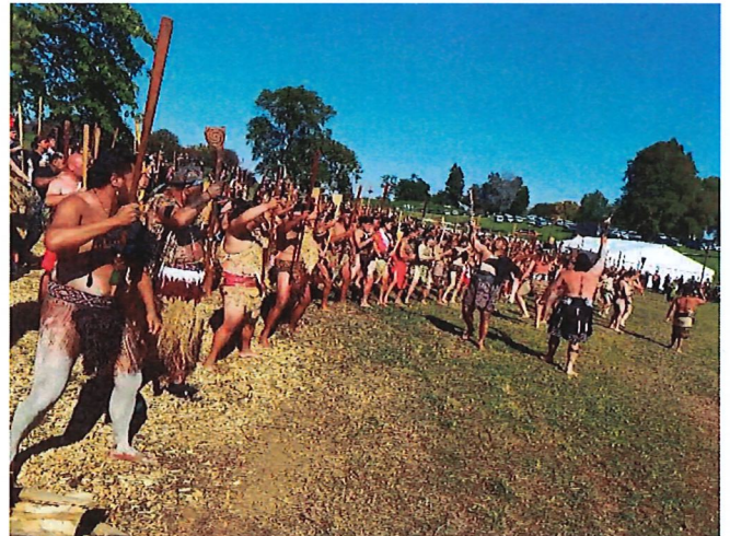
A large gathering of participants at Orakau