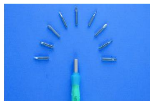
PARENTING Netsafe's Parent Toolkit Resource

Netsafe is leading the development of Aotearoa's first Online Safety Code of Practice. The Code is designed for ICT organisations providing services to people in New Zealand. Netsafe's research shows one in five adults and twice as many young people received a digital communication that negatively impacted their life in 2020. To put that in a practical context, as 2021 has progressed, Netsafe is continuing to record a new "high" in terms of the highest ever number of reports related to harmful digital communication. Digital technology continues to be an important part of how the community connects, learns and lives.