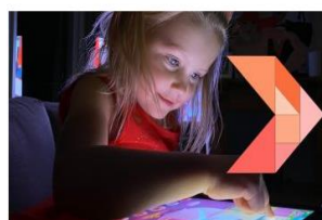
FEATURED | PARENTING Online Safety Parent Toolkit