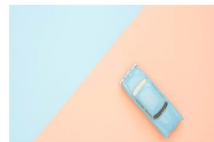
HOW TO | PARENTING | STAYING SAFE TikTok: Advice for Parents