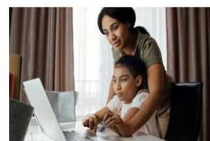
PARENTING | RECENT WORK | RESEARCH Parent awareness of children's online lives