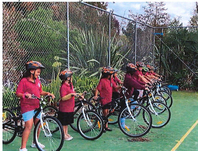
What a massive smile here