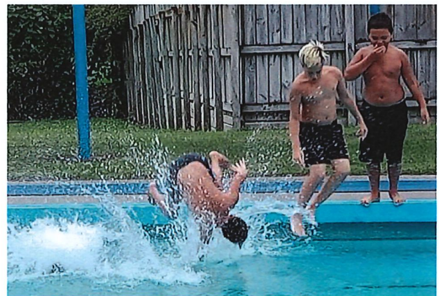
Whos' ready for a swim? Who's that in the picture?