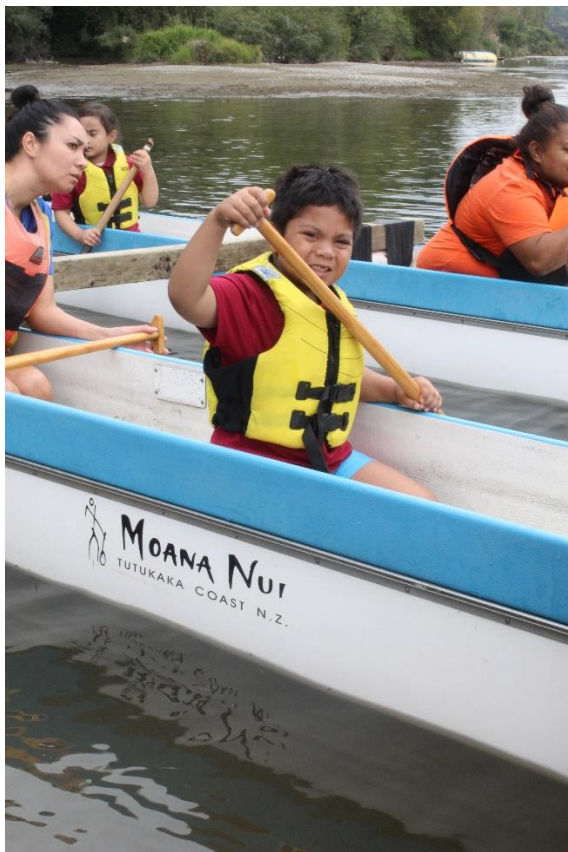
Yr 7/8 students back from a tiring paddle