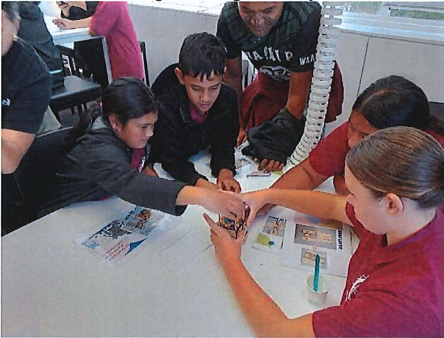
Teamwork – mission accomplished