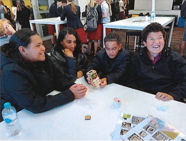
Completed Task – mission accomplished

Building a ‘Gumball Machine’ was a little tricky to start with but at the end of the session, all three teams completed the challenge