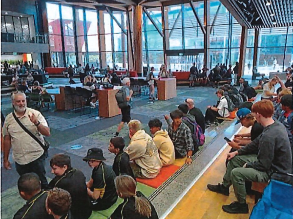
The main hall was full of people studying