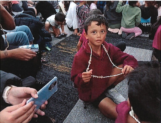
Everyone at the performance received a special gift before they left