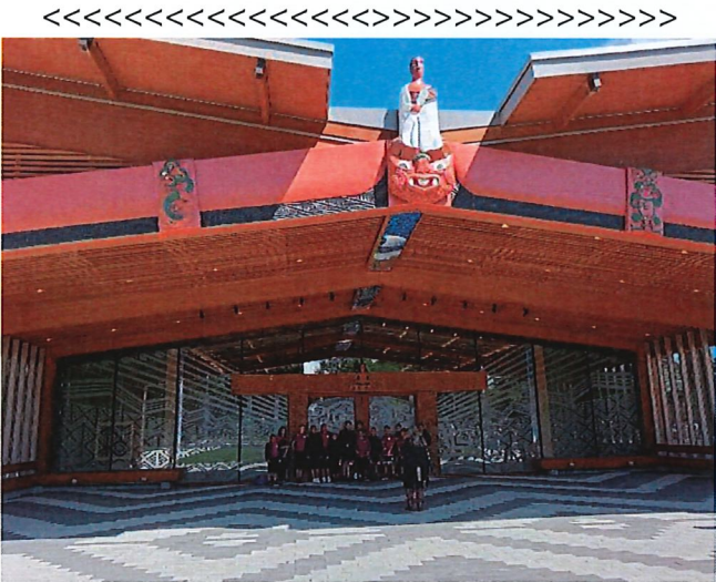
Waikato University Paa – Our students were here for the E-Velocity Project visit