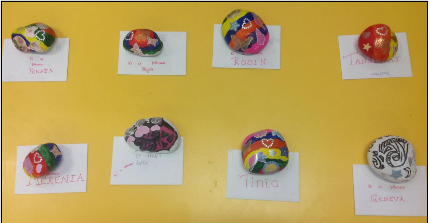
Their Painted and Decorated Rocks