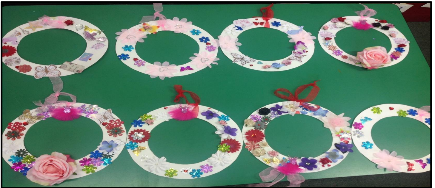
Their Flower Decorated Wreaths