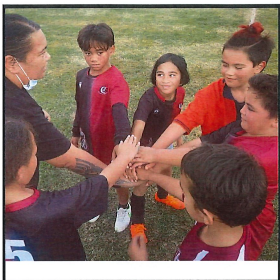
CPS HAWAIKI TUU

Nгаа mihi nunui tamariki maa - You all represented your kura with pride!