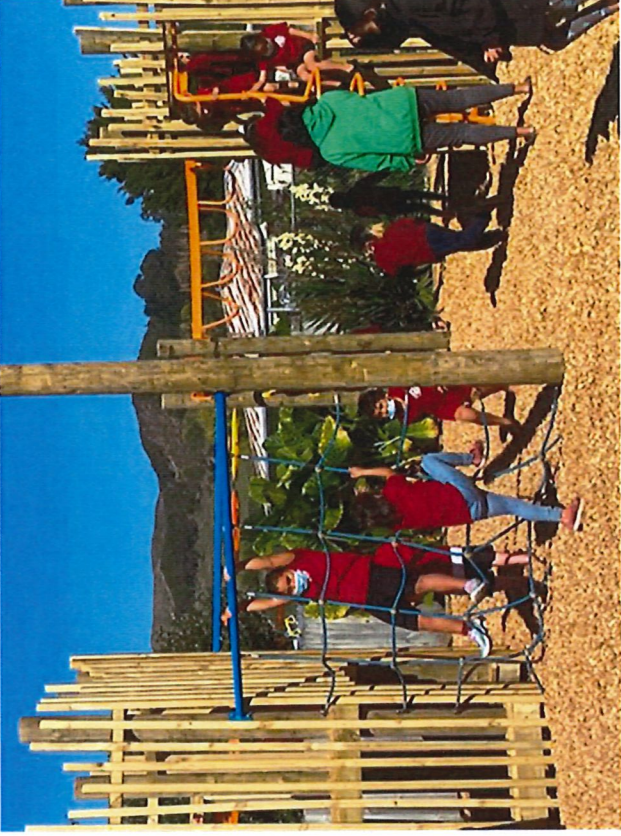
Matua Isaiah opens the playground with a karakia