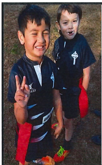
TAIAO & HATTA