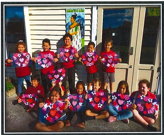
This is what Mana Tangata looks like in Room 2

Happy Mothers Day - Celebrating this wonderful occasion in Room 2 with some special Heart Wreaths for their mum's