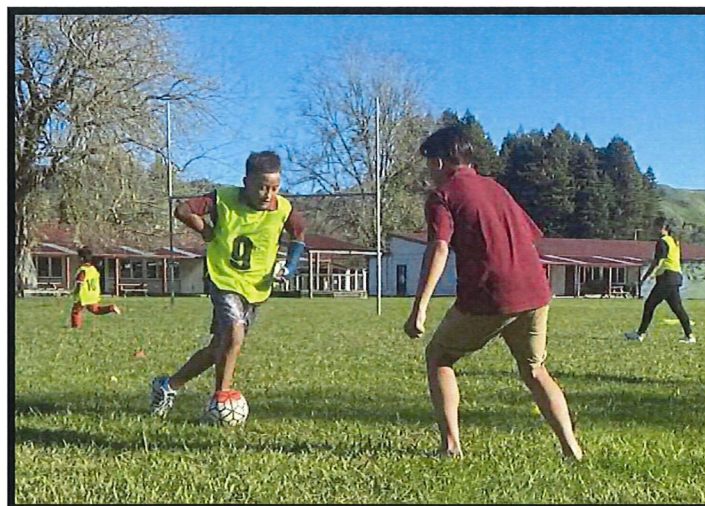
“Kia kaha korua”

Creativity: Our Orienteering senior boys gave an awesome example of Wairua Hihiko last Friday within their warm-up. Taking their own initiative to warm up before setting off on their hunt, but added a hint of their creativity to a basic stretch.