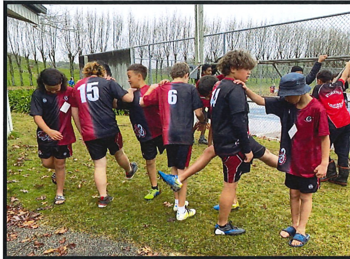
“Ka rawe tama maa!”

Creativity: Our Orienteering senior boys gave an awesome example of Wairua Hihiko last Friday within their warm-up. Taking their own initiative to warm up before setting off on their hunt, but added a hint of their creativity to a basic stretch.