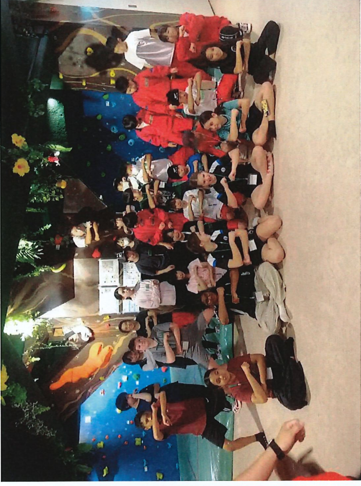
Rock climbing with Tatsuno Jnr High School students