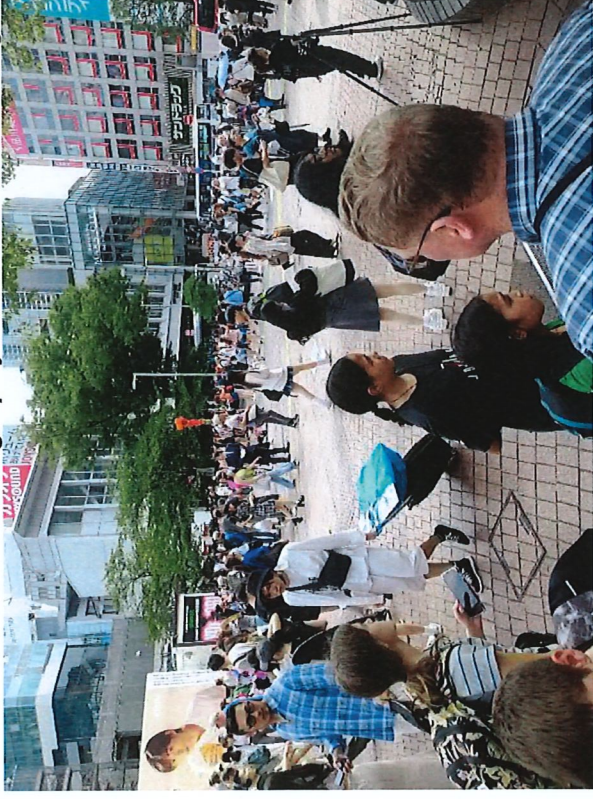
Shibuya Crossing – busiest in Tokyo 3000 every 2x min