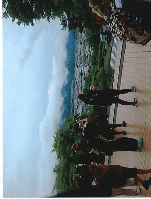
Hanan College visit: view over Tatsumo town