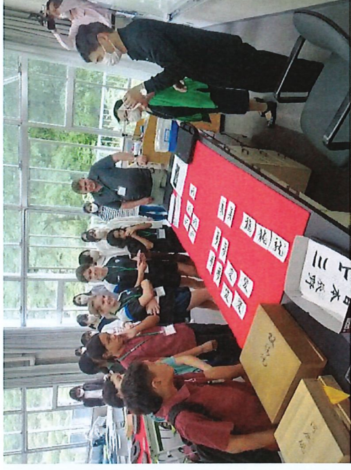
Top Japanese calligraphy expert demonstrates