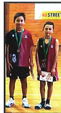
Singlet and shorts