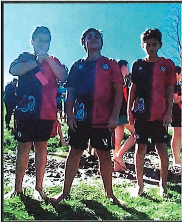
Soccer and Boys Netball Uniform