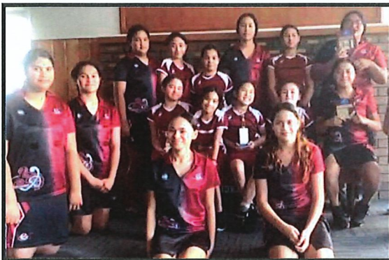
Both Netball Uniforms