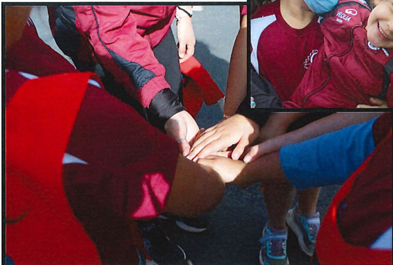
CP Ihi having their 3 Cheers