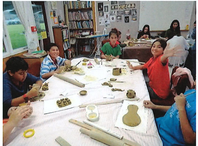
They really enjoyed this experience.

The Waitomo Society of Arts worked with our students - focusing on clay.