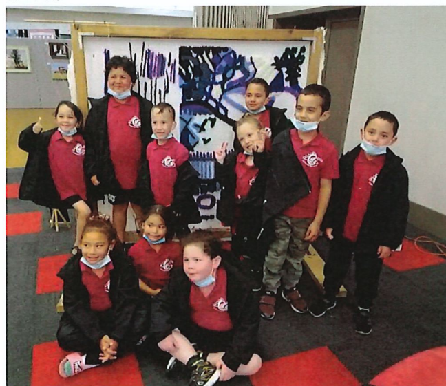
This was a 'crazy mat' where the artist made it up as she machined it across

The Art Exhibition at the Les Munro Centre last week provided our tamariki with some inspiration as they cast their eyes over the many different types of work.