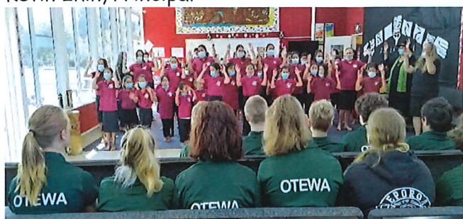
Otewa senior students welcomed to our kura