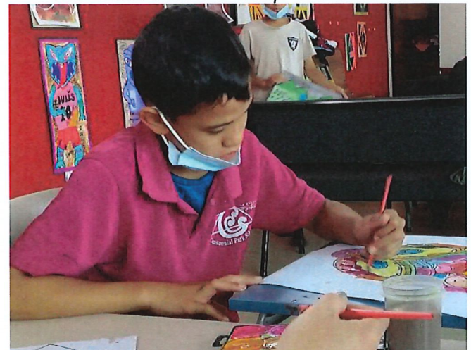
Totara focused and determined