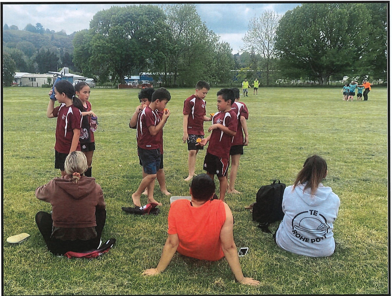
CP JUNIORS having orange time at half-time.

" PLAY HARD BUT PLAY HUMBLE TAMARIKI MAA "